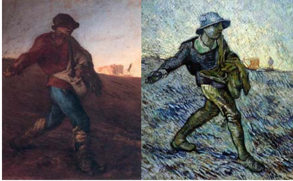
The Sower by Jean-Francois Millet (left) and Vincent Van Gogh (right)

Pastiche is an artistic form that can be found in literature, art, architecture and music. In one meaning of the term, it is a hodgepodge of different styles blended together to create a new form. An example of this in theatre would be Tom Stoppard's Rosencrantz and Guildenstern are Dead , which is a pastiche of Hamlet , Waiting for Godot , vaudeville and existentialism.