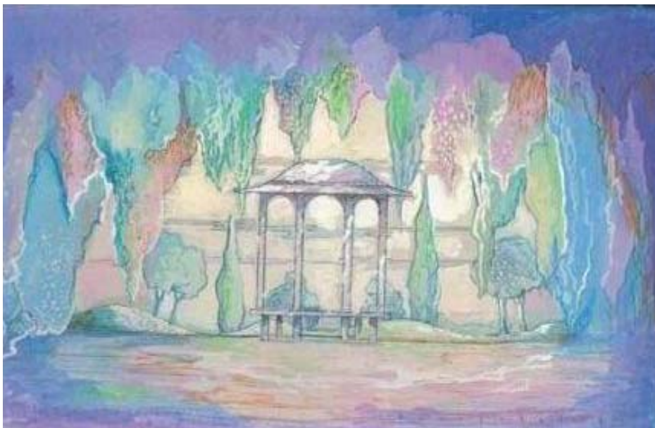
Set sketch for The Drowsy Chaperone by J.C. Olivier

"It's a rare evening when a musical makes me laugh out loud and often but it happened last night." The London Evening-Standard